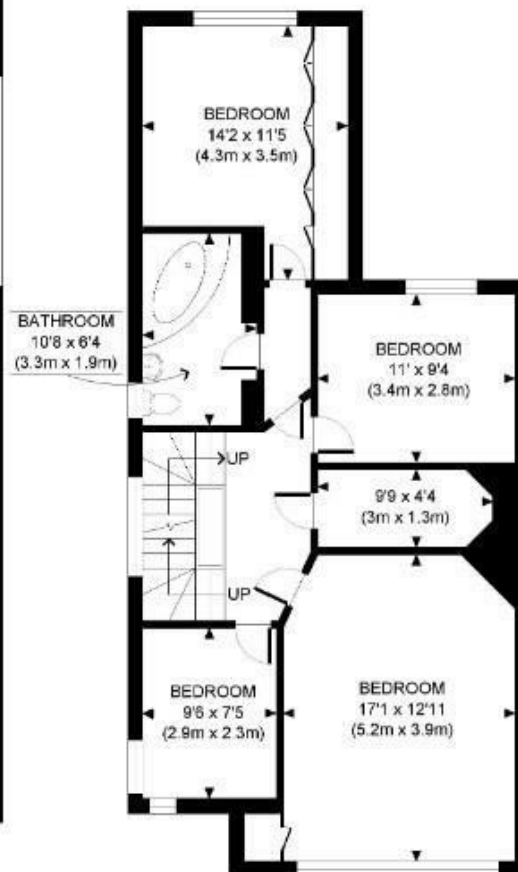
FIRST FLOOR GROSS INTERNAL FLOOR AREA 807 SQ FT

APPROX. GROSS INTERNAL FLOOR AREA: 2247 SQ FT/ 209 SQM