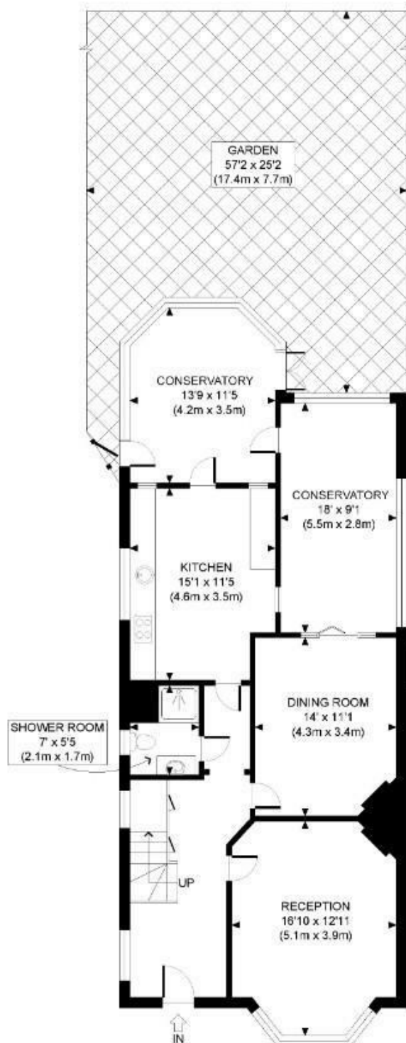
GROUND FLOOR GROSS INTERNAL FLOOR AREA 1075 SQ FT