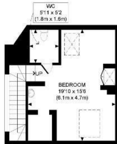
SECOND FLOOR GROSS INTERNAL FLOOR AREA 365 SQ FT